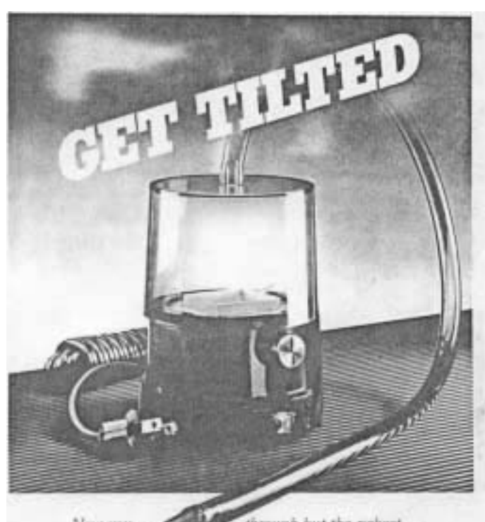
DIAGRAM 1. Tilt Advertisement

Now you can reduce the hazards of smoking. Without reducing the pleasures. With The Tilt, the world's most intelligently engineered